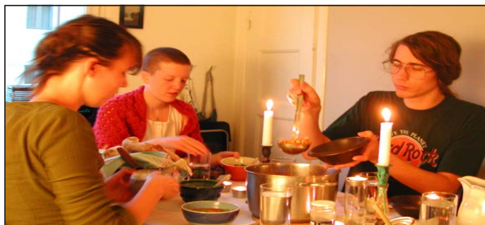
It is socially sustainable to eat together.

Conscious and energy efficient consumption. In a sustainable future food processing happens in three places; at home, in restaurants and in institutional kitchens. The trend towards increased industrial food processing compared to home cooking has been reversed, mainly due to a stronger contact between producers and consumers. Restaurants and take-away are located at the local squares. Cooking and eating together is socially sustainable. More energy efficient white goods has led to more energy efficient cooking.