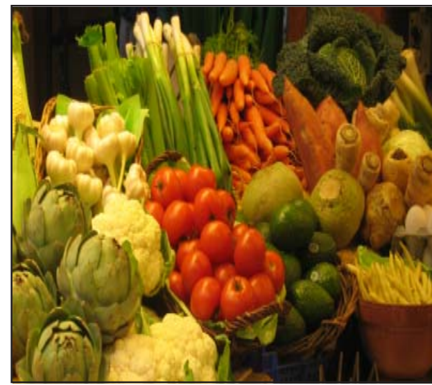
In the sustainable diet we eat a lot of vegetables.

For further reading see "Mat Göteborg 2050" (in Swedish), available at www.goteborg2050.nu